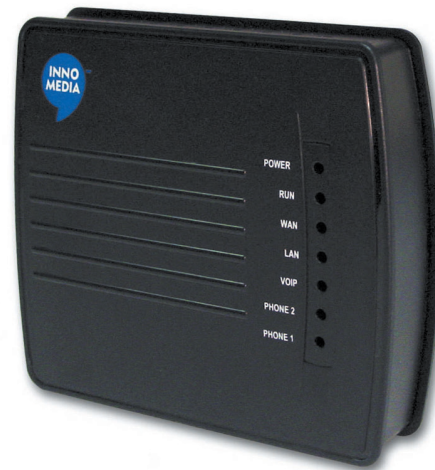
Standalone MTA 6328-2Re with 2 voice ports

VoIP performance metrics reporting allowing service providers to offer SLA based services