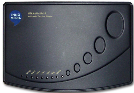
Standalone MTA 6328-1Be2S with 1 voice port

Battery backup ensures operation in the event of power failure