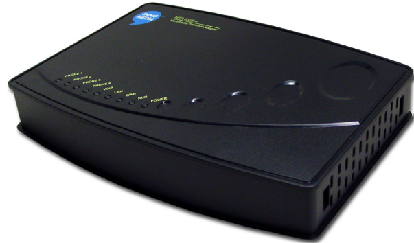
Standalone MTA 6328 with 4 voice ports

CLASS Feature Support with Call Agents or Softswitches