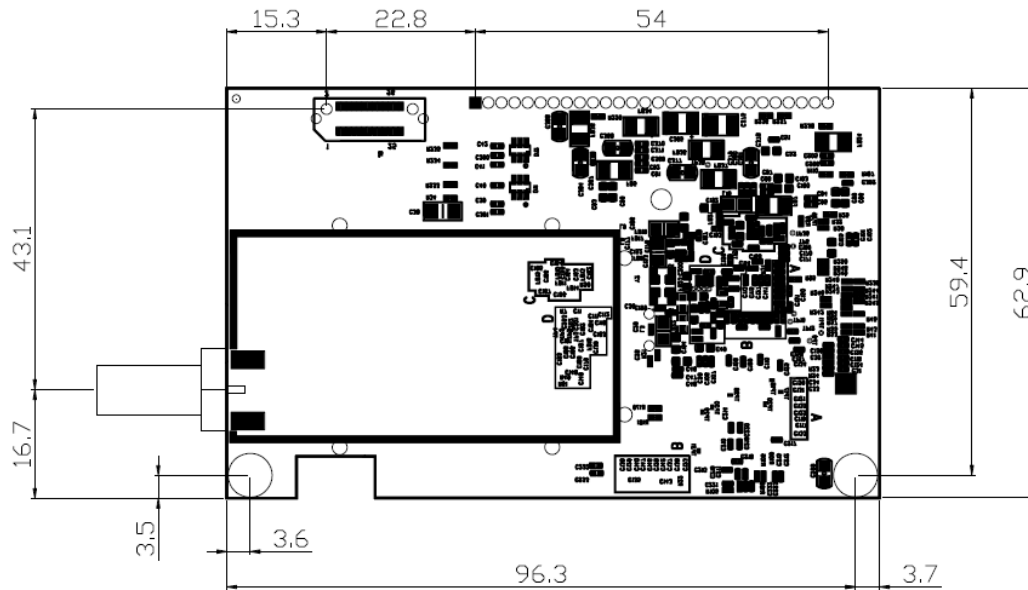
Bottom view of PCBA