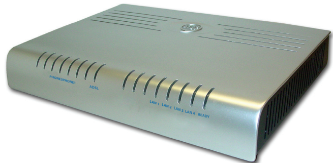
Standalone MTA 6628-2Be4S with 2 voice ports

Integrated with ADSL/ADSL2/ADSL2+ modem to deliver high-quality voice, wire-speed routing, and port based PVC management and quality of service (QoS) control, MTA 6628-2Be4S is ideal for ADSL access service providers to deliver ADSL-based residential or SOHO triple-play services. It also ensures uptime for their end-users with an internal battery backup for up to 2 hours of talk time in the event of a power failure.